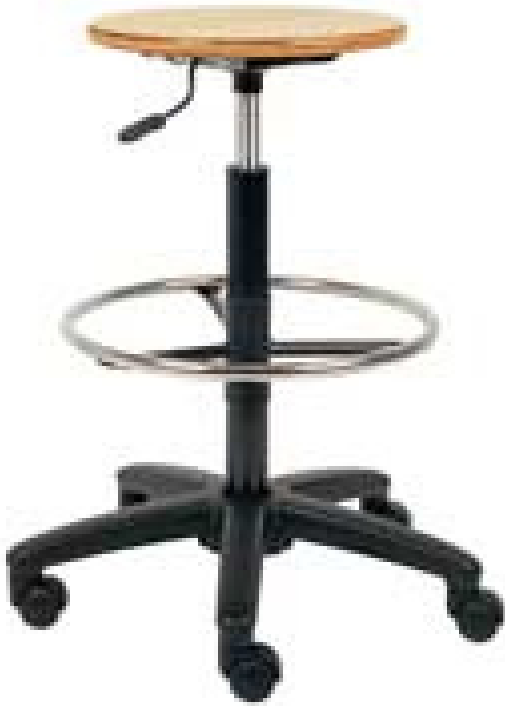
BLS02CW WOOD SEATED LAB STOOL WITH CASTORS