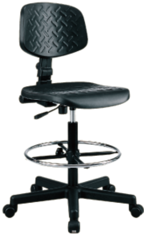
BLC01CW PU SEATED LAB CHAIR WITH CASTORS