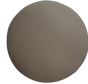
FOAM CUSHIONED SEAT - SELECTED COULRS