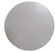
PU PAINTED FINISH - ANY RAL COULRS

Custom made Height Adjustable - threaded rod Heavy duty threaded rod for height adjustment Laminated / veneered / painted plywood for the seat MS Tube epoxy powder coated frame & foot ring Seat Height Range: 580~835mm Seat dia: 300mm Seat thickness: 24mm