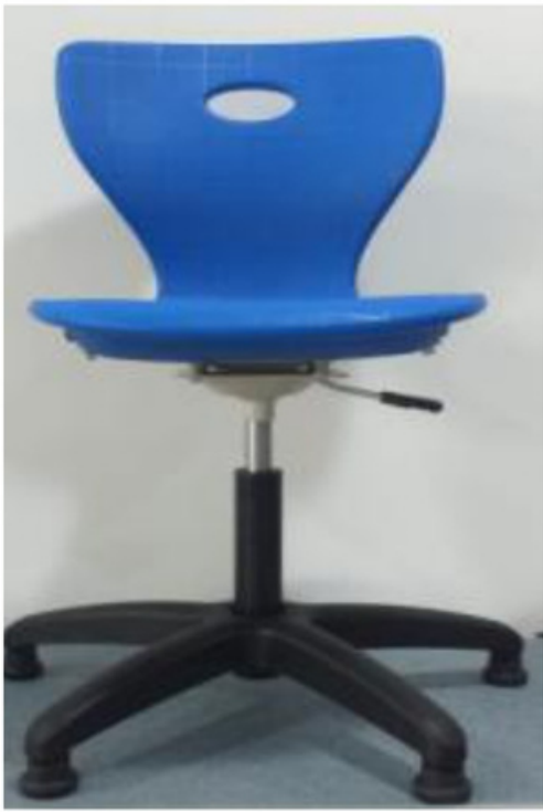
BLC04CW BLOW MOLDED SEATED LAB CHAIR WITH CASTORS