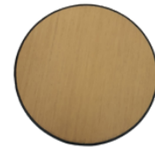
VENEERED WOOD SEAT - SELECTED WOOD FINISH